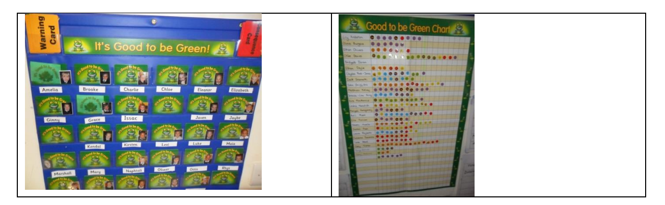
Every day a fresh start - Behaviour Chart