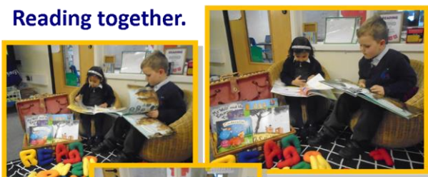
The children reading amazing stories in the reading corner.